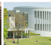
Shonan Fujisawa Campus